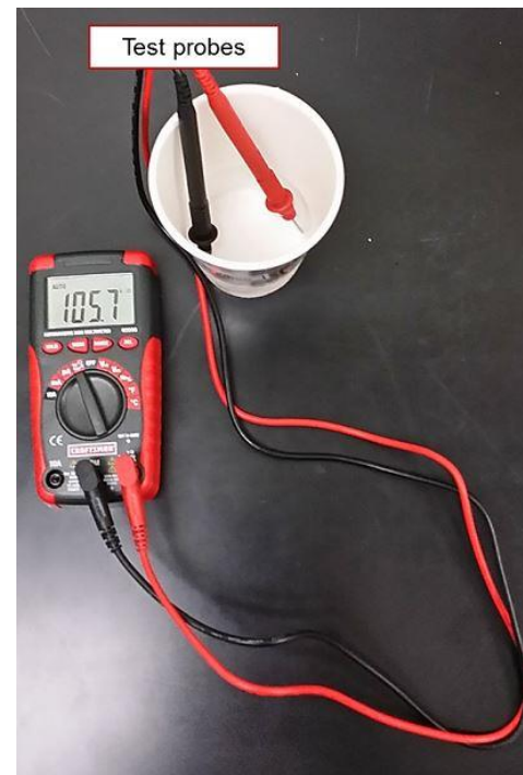
Figure 3. Setup for resistance measurement using digital multimeter.