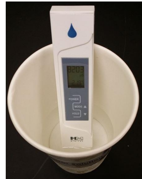
Figure 2. Electrical conductivity tester.