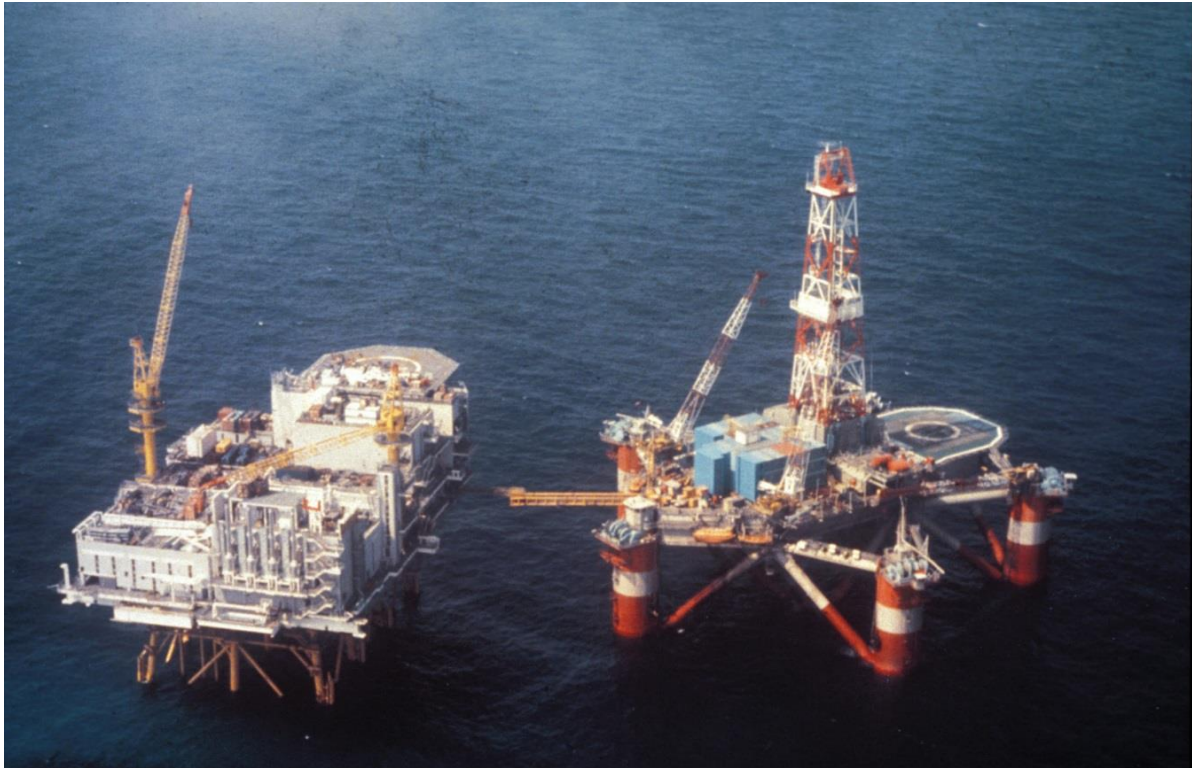
The intact Alexander Kielland drilling platform.