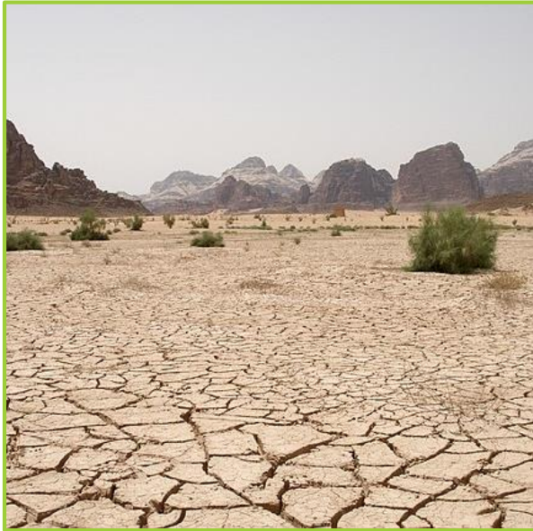
Wadi Rum Dry Desert, Jordan