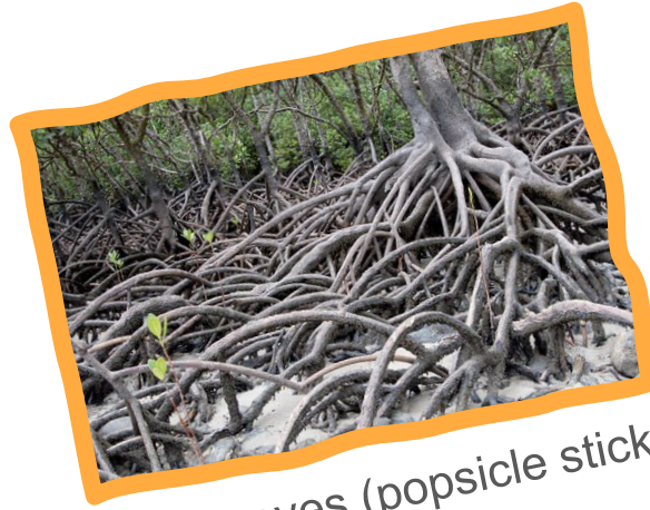
Mangroves (popsicle sticks)